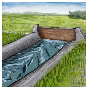
Alternate wetting and drying

Background. AWD is a management practice in irrigated lowland rice fields characterized by periodic drying and reflooding of the fields. Traditional flooding of rice areas creates anaerobic decomposition of organic matter that causes methane production, a GHG 34 times more powerful at trapping heat in the atmosphere than \text{CO}_2