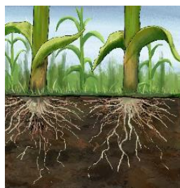
Soil management improvements

Background. Improved soil management in smallholder farming can increase crop nutrient supply, soil water retention, prevention of erosion, and carbon sequestration (Cheesman et al. 2016). Regular and appropriate supply of organic matter to soils, such as compost, manure and crop residues, is essential to maintain or increase production