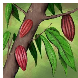
Perennial crop expansion

Background. Perennial crops provide multiple benefits to cropping systems. They improve soil fertility, reduce runoff, prevent high water evaporation and protect soil from wind erosion (Jose, 2009). The increased organic matter inputs to soils through leaves and branches, shading from high temperatures and