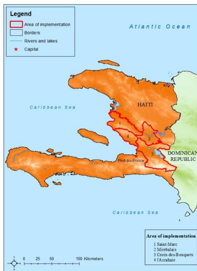
Figure 1. Area of implementation