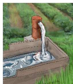
Water management improvements

Background. Targeted water management can strongly increase crop yields. It also has the co-benefit of contributing to carbon storage in soils through higher crop residue returns (Smith et al. 2007). While crop residue can be used in various ways, the retention of a minimum quantity is strongly recommended to guarantee organic matter